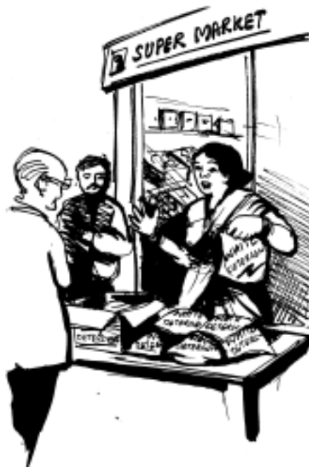
Fig. 19.3: Product demonstration

This is often done by giving samples of the product for use by consumers or by offering a discount on the product. Have you ever been offered samples of products by salespersons?