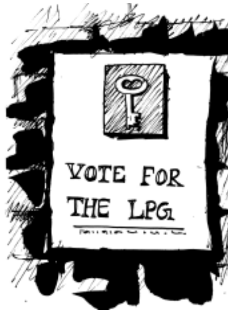
Fig. 19.6: Election poster

Several schemes are announced for the benefit of the public such as the sale of essential commodities like rice and wheat at affordable prices through the public distribution system, educational concessions for children etc.