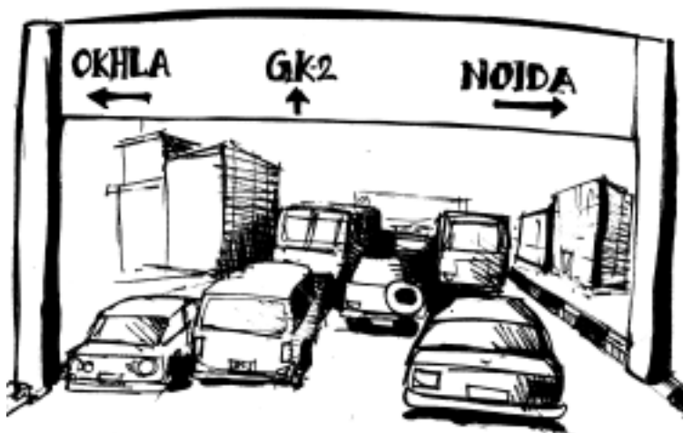
Fig. 19.1: Sign boards

The sign boards that you find on the roads is a simple example of public relations.