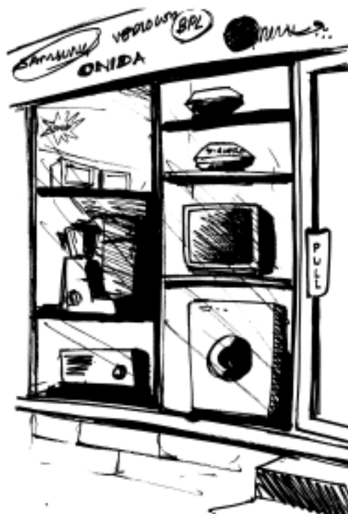
Fig. 19.4: Window display

You will learn about some of these methods in the next lesson.