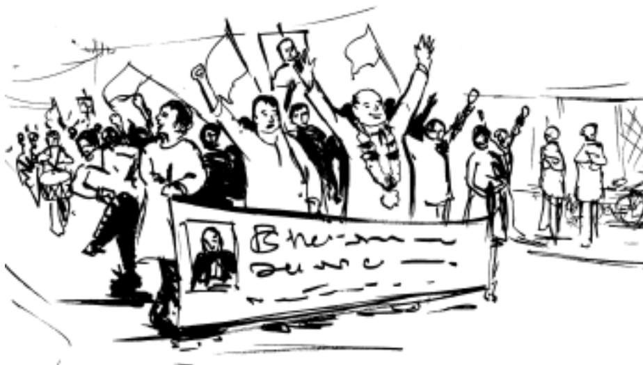
Fig. 19.5: Political rally

In order to gain the confidence of the people and persuade them for their votes, campaigns and meetings are organized.