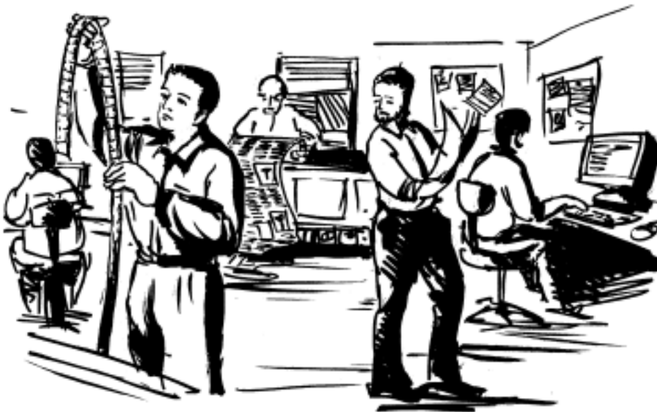
Fig. 22.2: Convergence

Keeping this reality in mind, media organisations are also expanding and trying to bring in different elements of mass communication under a common roof. In a global media environment, we will now find more and more media organisations running print, television, radio and new media divisions together.