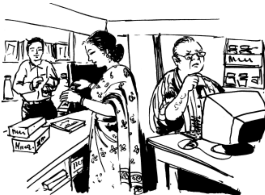
Fig. 22.1: A customer is looking at a web page and trying to identify an item for buying. He has a very puzzled look. There is another customer who is buying things from a shop. She has a satisfied look on her face.

This was also a learning phase for Indian media practitioners and managers. They realized that if they ventured into new media, they had to think of innovative revenue models. They also accepted that they had to sell content to make money. Otherwise, merely getting into business transactions wasn't helping them at all.