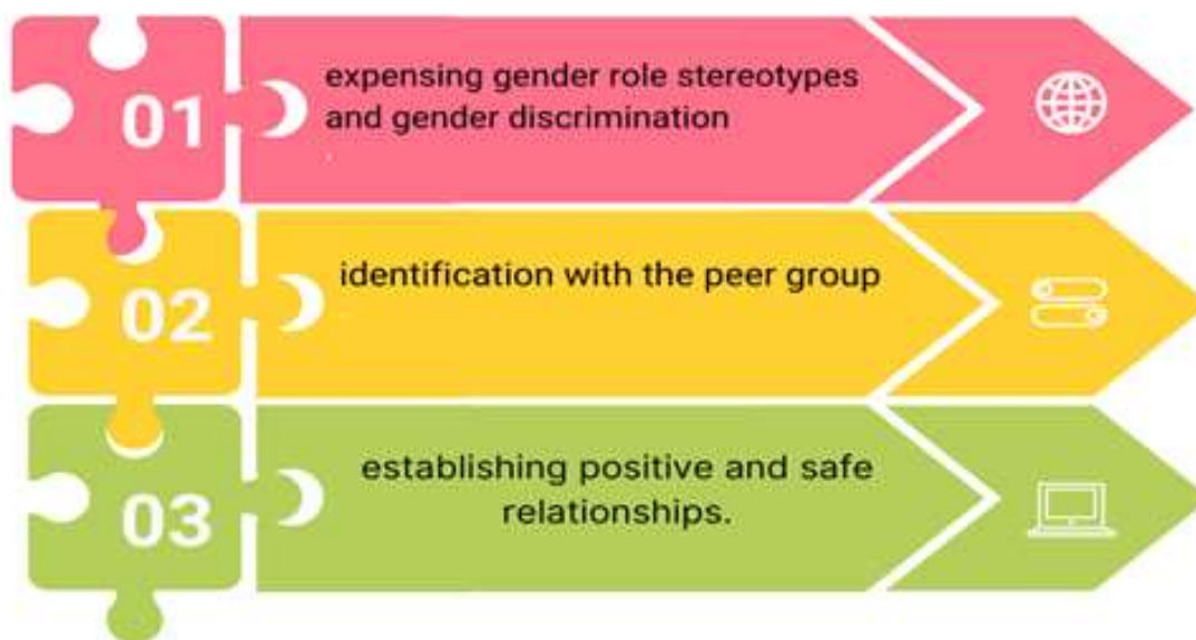
Fig 13.1: Socio-cultural Challenges faced by adolescents

It is unfortunate that even in modern times, gender roles may be stereotyped, which also affects how girls and boys are brought up. For example, boys are given nutritious food,