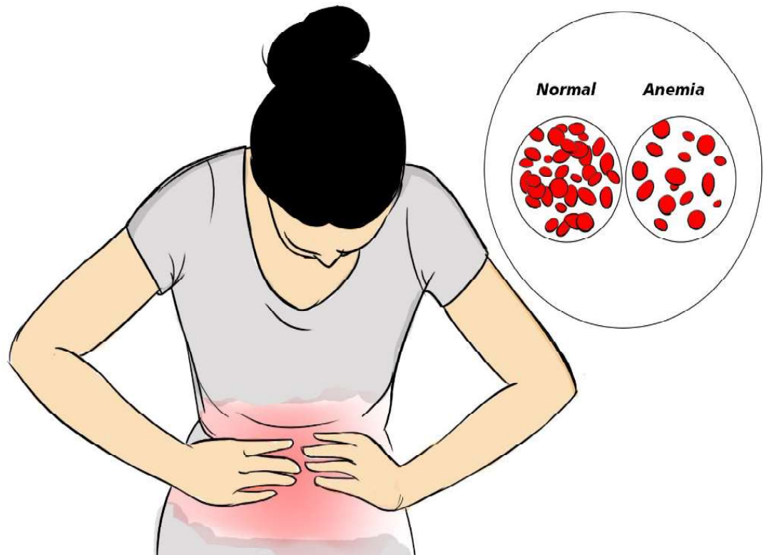
Fig. 13.2: Cases of Anemia among girls

During adolescence, boys and girls become biologically capable of sexual activity. Due to the action of sex hormones, they not only mature sexually but also develop secondary sexual characteristics. However, adolescents are not mentally or psychologically mature enough to