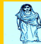
Figure 14.2 Understanding the Health of Women