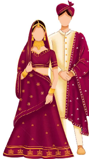
Figure 15.1 Marriage: A Social Institution

In India, there are several laws that come separately under the marriage and family laws. These refer to determining the age of marriage as well as the process of its legal registration in different communities.