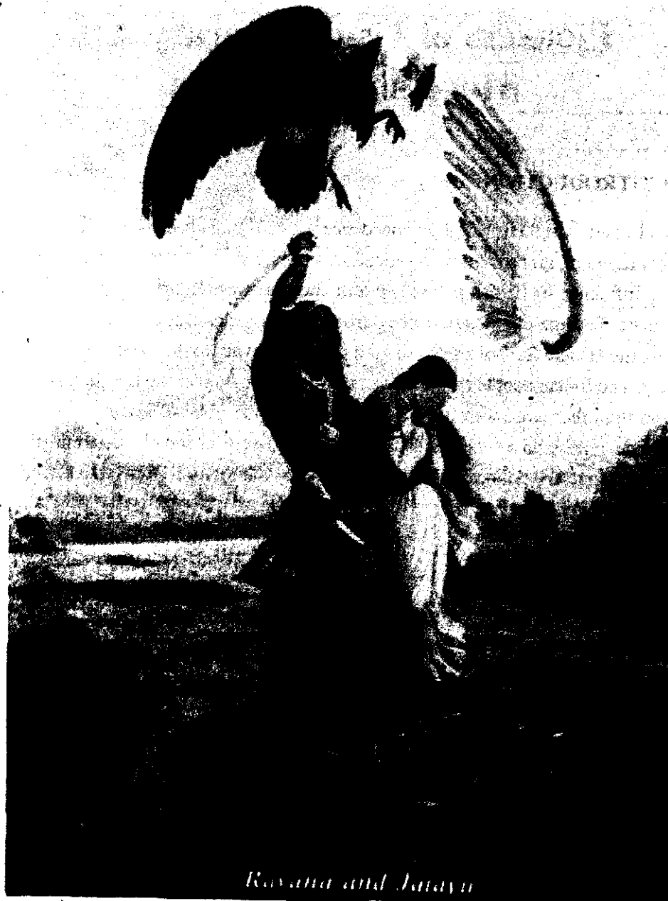
Ravana and Jatayu

While travelling into India, British brought prints of paintings from Europe. The availability of European prints provided Indian artists new modes of expression and new ways of looking at problems of naturalistic representation. This European component in Mughal painting was a lasting contribution that filtered through into the later regional schools from which Company artists were recruited. Many of the traditional artists got opportunities to see them at work. It was in this informal and un-programmed way that the Indian artists of, what has been called the Company School of painting, gained some skill in the Western type of realism. When this change was taking place arose one artist who became the legend of Indian paintings of modern era in the form of Ravi Varma (1848-1906)