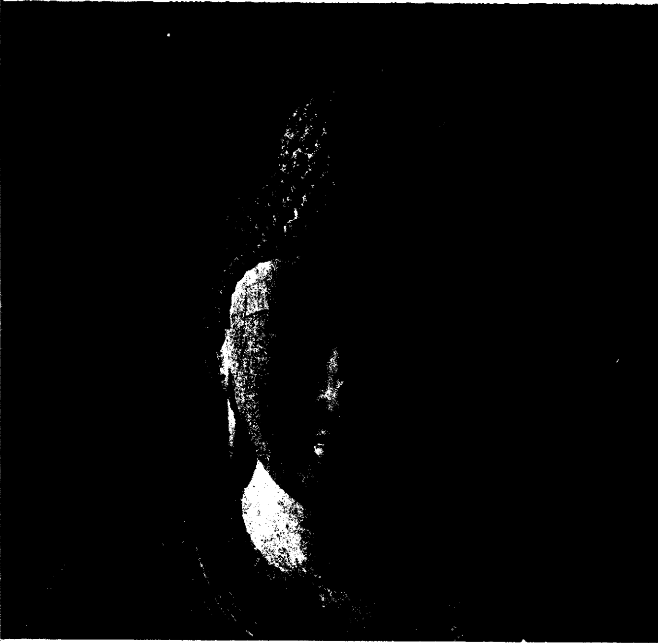
Seated Buddha (Gandhara Style)