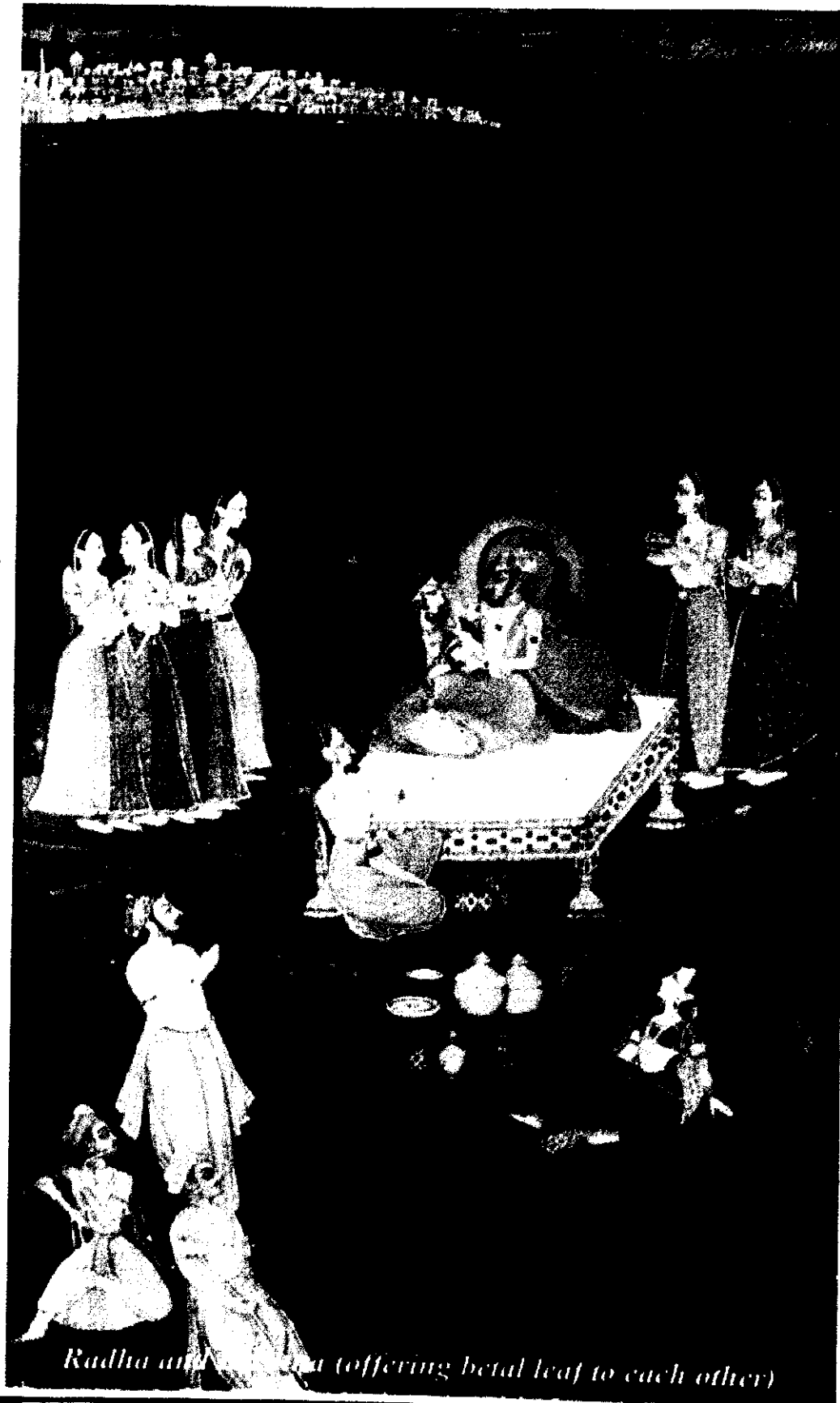
Radha and Krishna (offering betel leaf to each other)