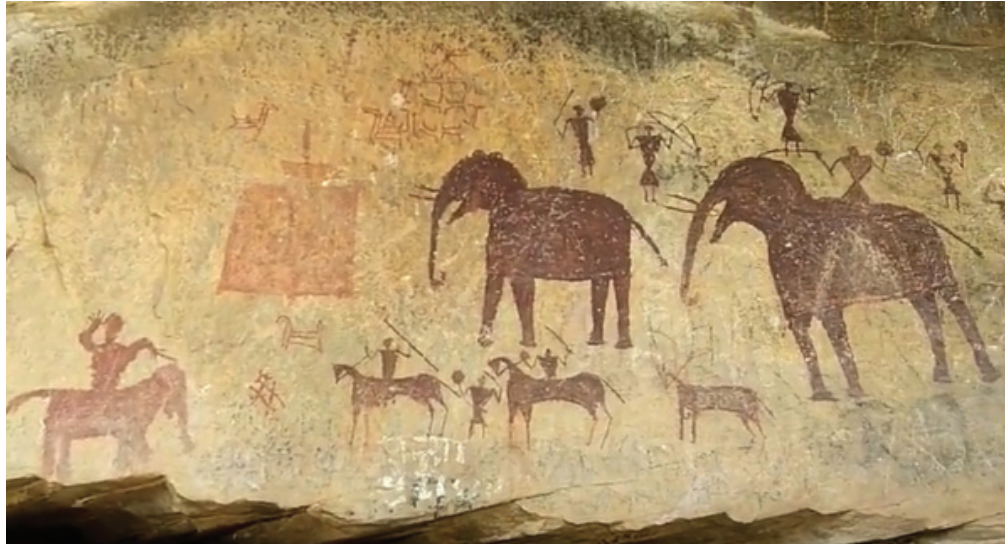
Fig. 1.1: “Primitive Hunters” Mirzapur

Primitive men used to hunt large and dangerous animals in groups. The painting also shows a group of people chasing the animals, surrounding them, and killing them with their primitive weapons. The colours are very limited, used to give volume to these figures. In some cases, they have used red, black and yellow pigments. The animals appear to be much more completely rendered than the human figures.