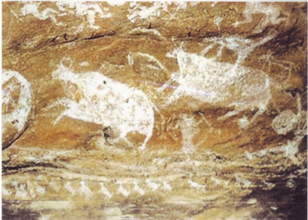
Fig. 1.2: "Rows of Cows", Panchmarhi

'Rows of Cows' is one of the many paintings at this site. It shows a cowherd driving a herd of cows to the pasture. The stylized drawing of the cows is almost geometrical, yet it shows a lot of movement both in the animal and human figures.