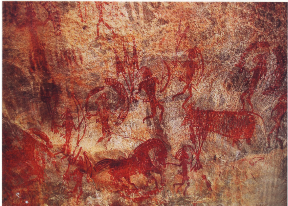
Fig. 1.3: “Fighters” Bhimbetka