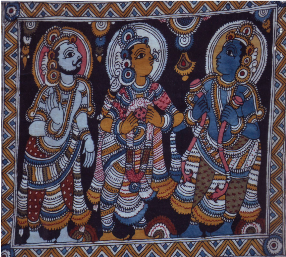
Fig. 15.5: Sita Swayamvar