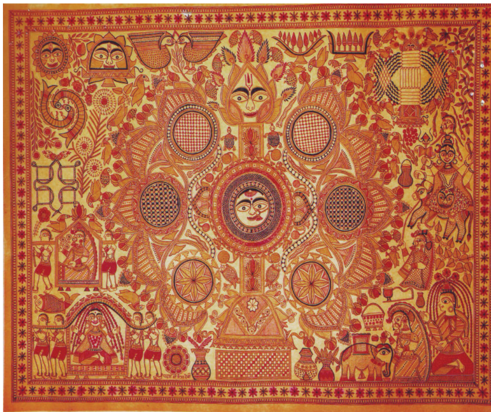
Fig. 15.3: Kohbar Ghar

Madhubani paintings are also called Mithila paintings. This genre of painting originated in the Mahdubani district of the Mithila region in Bihar. Traditionally, the paintings were made by women on the mud wall of the Kohbar (bridal chamber), so their theme was Hindu mythology and local beliefs. Painted with the